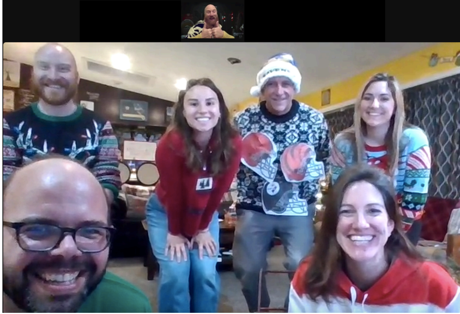
THE CLASS OF 2024!